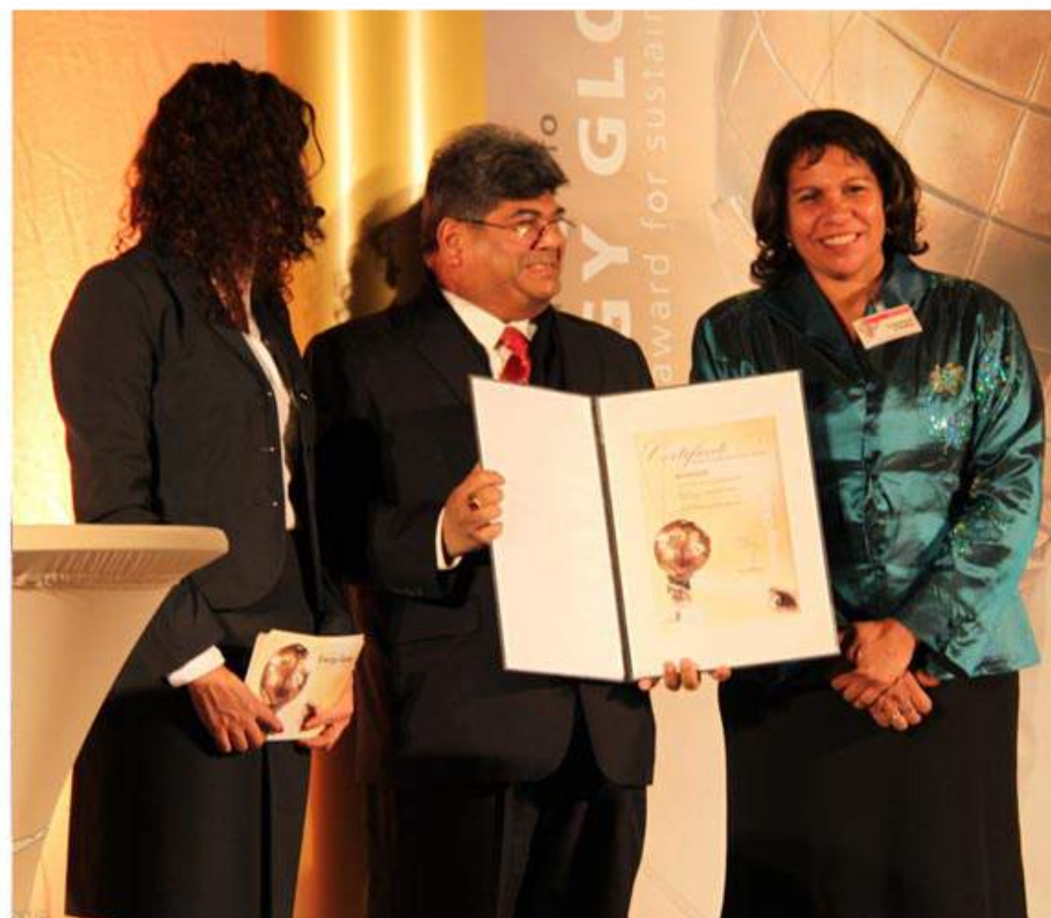
Receiving the Energy Globe National Award for the Energy Star project