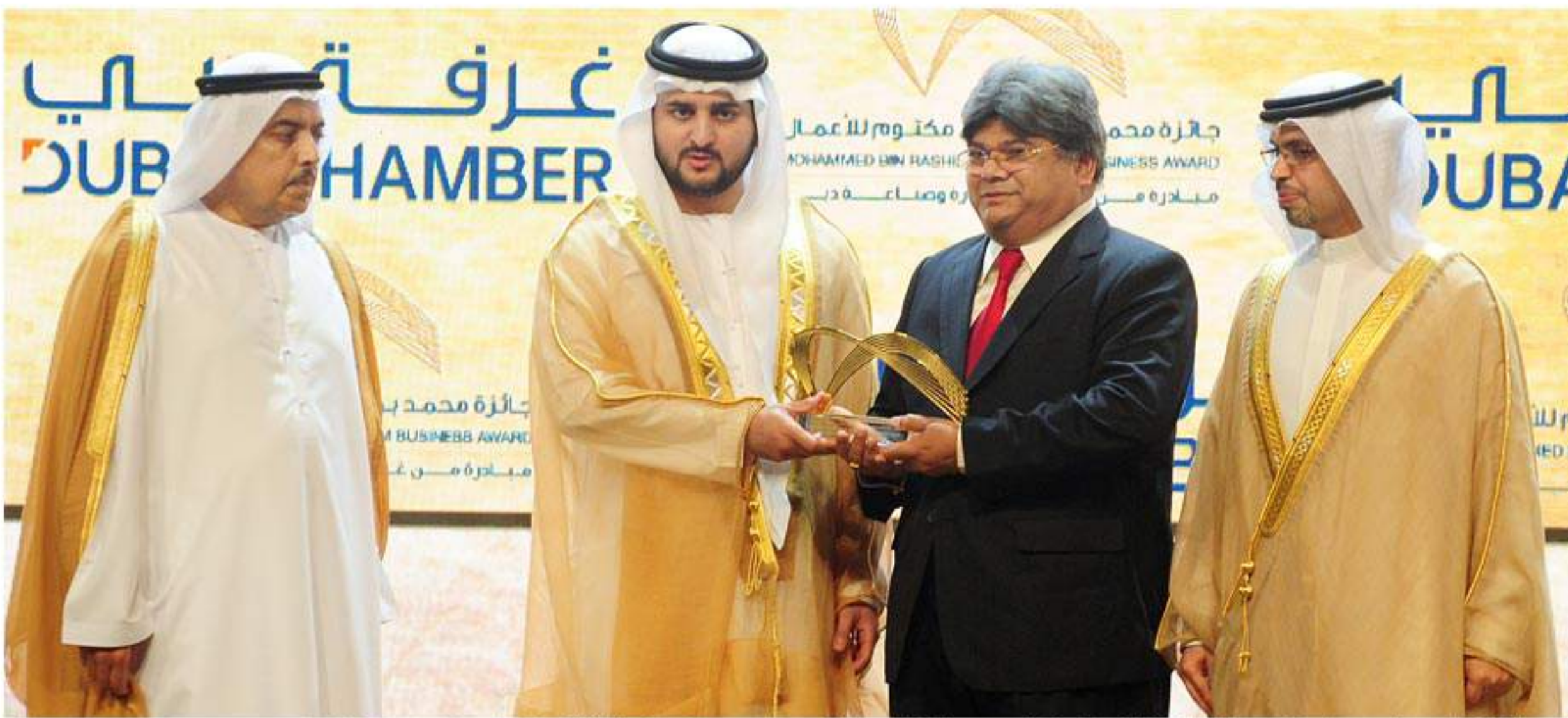
Pacific Controls wins the Middle East's most prestigious "Mohammed Bin Rashid Al Maktoum Business Award 2013"

Experts and Mobile Networks to reduce the operating costs of facilities. Some of the additional benefits offered via the programme are creating business intelligence through data collected and analysed from thousands of devices connected across buildings.