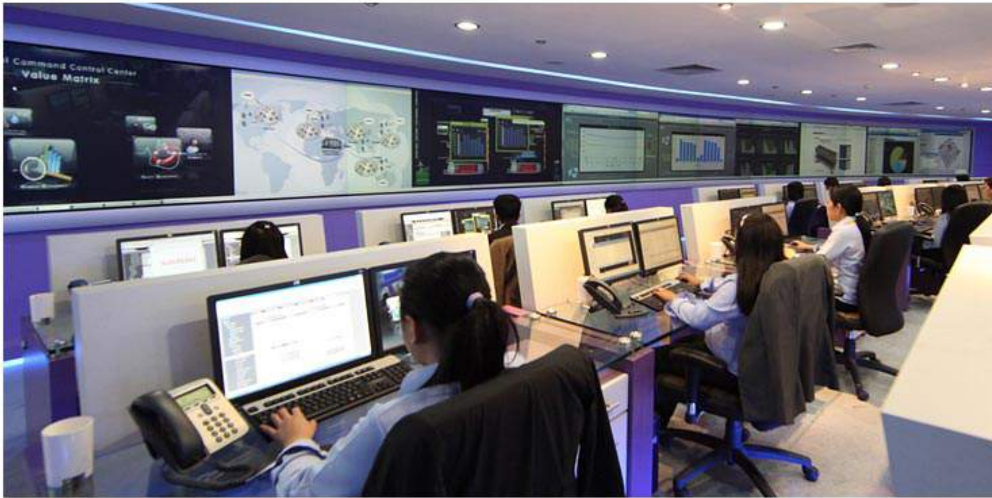
One of the five Pacific Controls state-of-the-art Command Control Centers providing 24/7/365 support