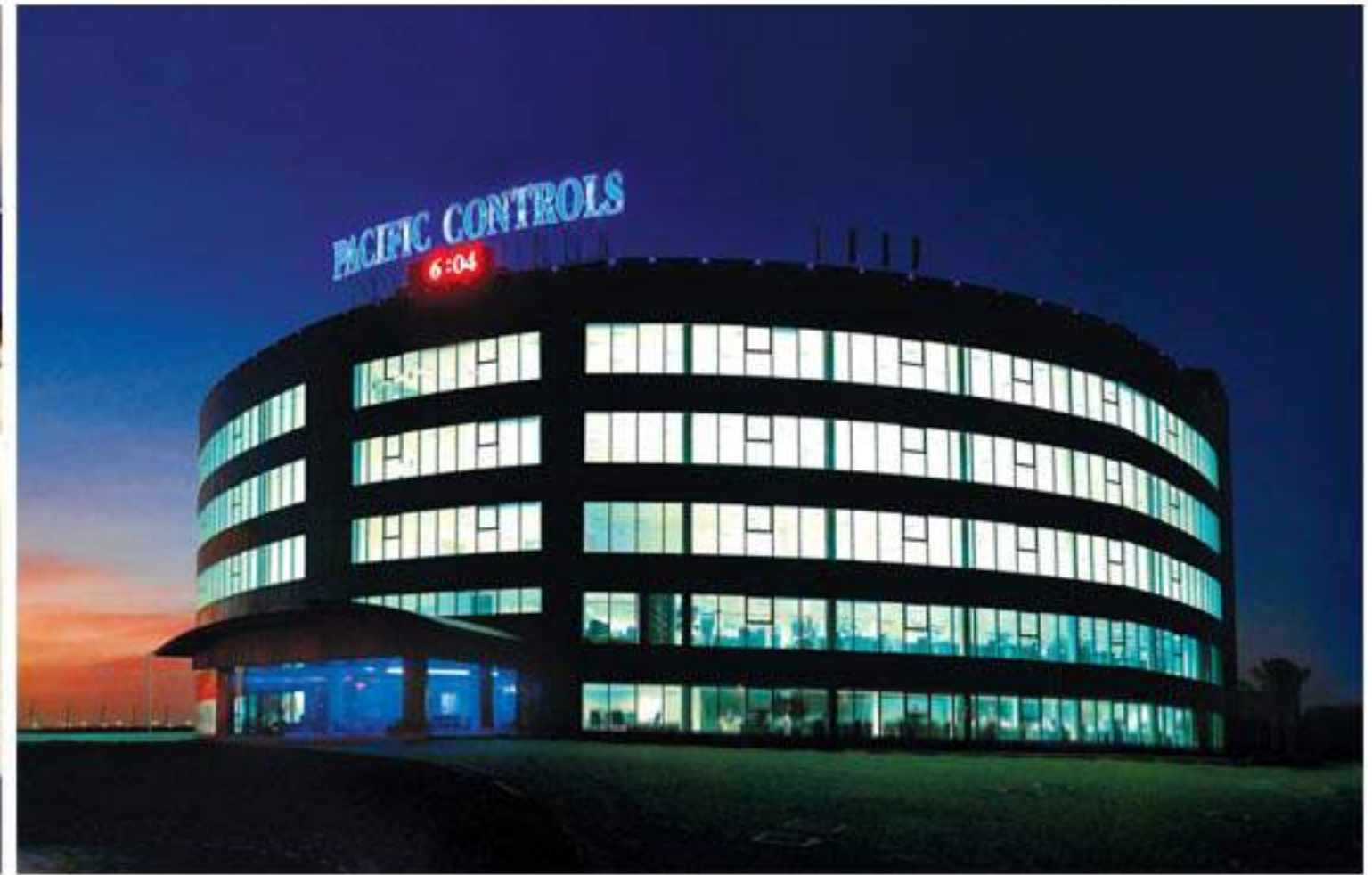
The Pacific Controls Global HQ in Dubai. A hub of buzzing activity, 24/7.