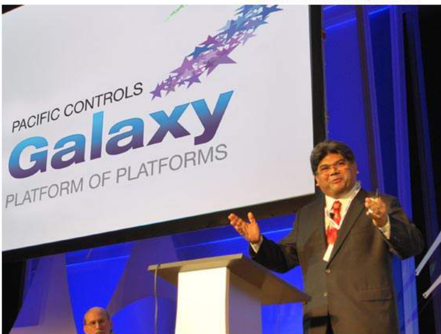
At the launch of the integrated managed solution platform 'Galaxy'