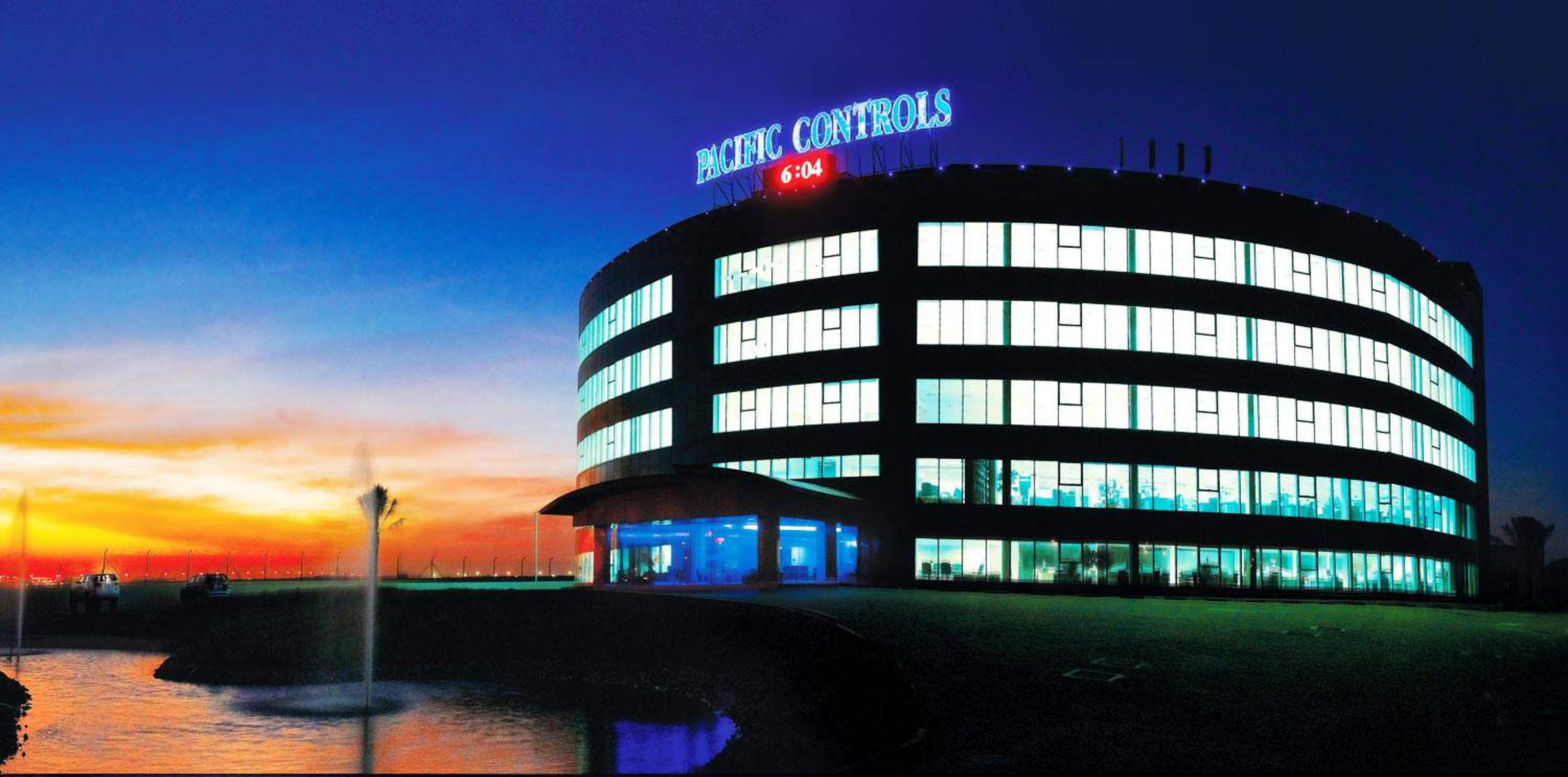
Pacific Controls Head Quarters: The first Platinum Rated Green Building in the Middle East and the 16th in the World in 2006.