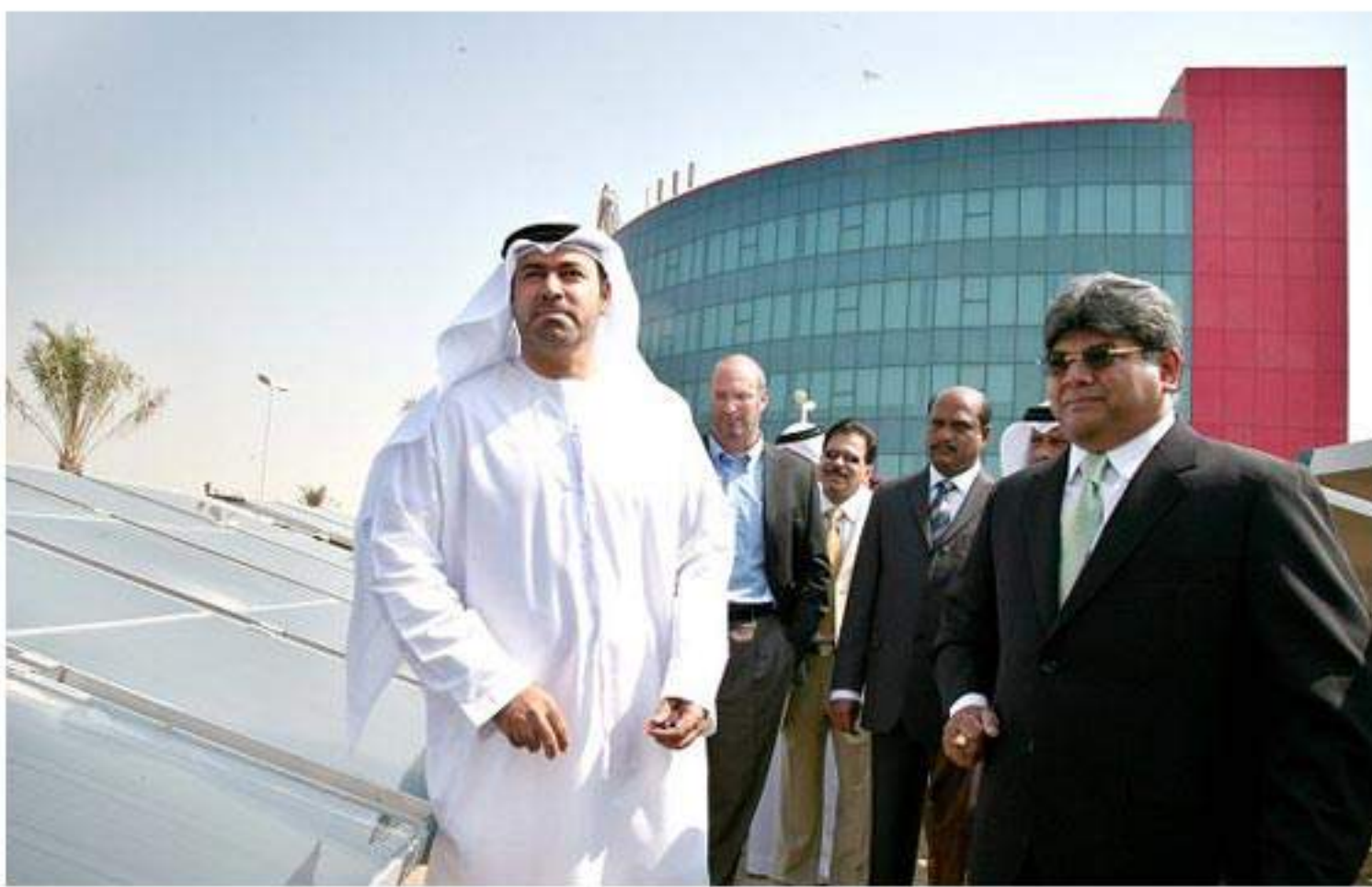
H.E. Mohammad Al Gergawi, Minister of State for Cabinet Affairs of the Federal Government of United Arab Emirates and Executive Chairman of Dubai Holding, with Dilip Rahulan taking a look at the solar farm after the inauguration of the Pacific Controls Green building in Dubai.