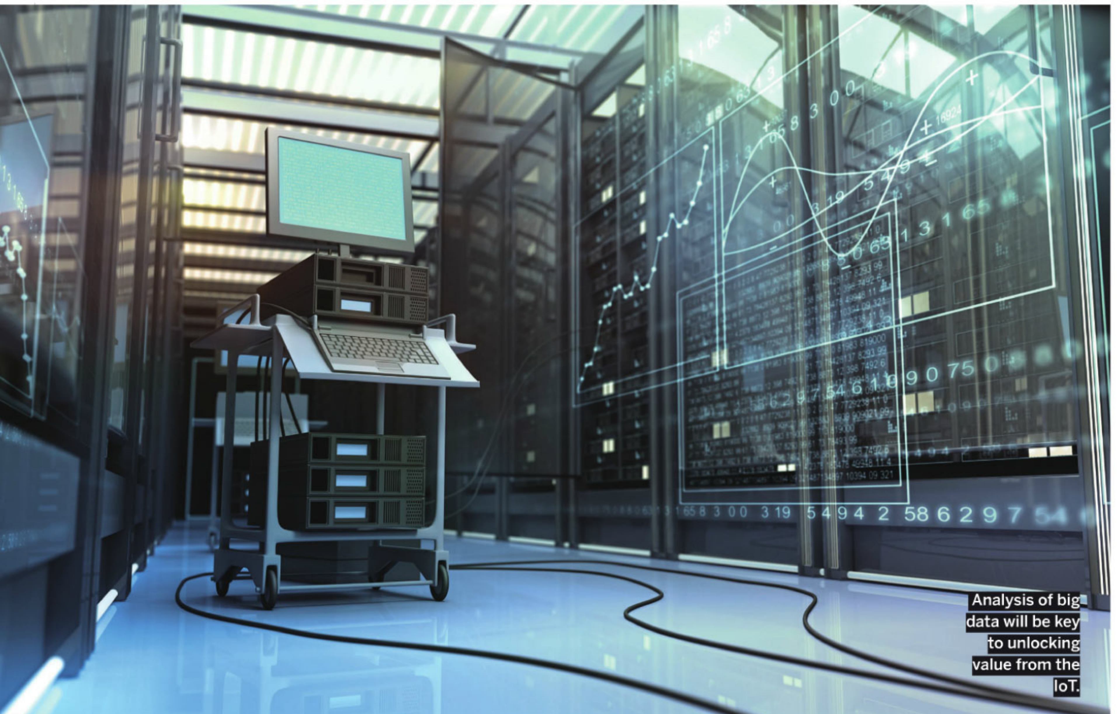
Analysis of big data will be key to unlocking value from the IoT.